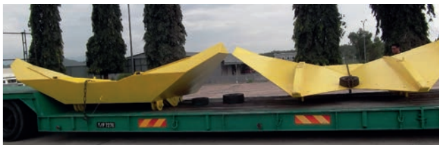
Oil & Gas Projects "Singapore delivery to Ranong Thailand by road using 13 x Flatbed OOGs for the ON shore Oilfields in Myanmar".