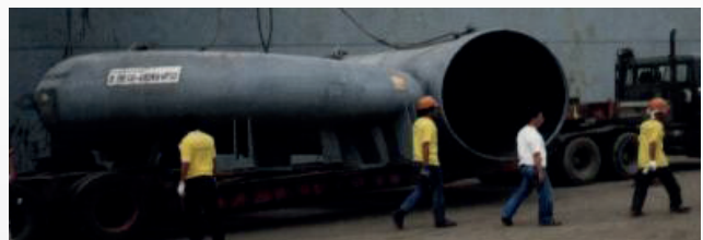
DIRECT TO TRUCK UNLOADING OF 2 UNITS OF SPIRAL CASINGS WHICH HAS A WIDTH OF 22 FEET / 36 MT AT THE PORT OF MANILA