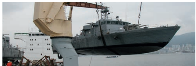
Loading and Unloading of 2 units PKM (Patrol Killer Medium) Gunboat from Busan Port, Korea to Manila South Port Anchorage Area . Total Weight : 299.28 MT Total Measurement : 5863.732 CBM