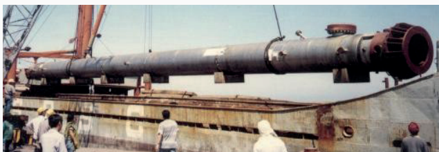
SHIPSIDE UNLOADING OF A 29 MT, 139 FEET LONG SPLITTING COLUMN UNTO A BARGE AT MANILA PORT FOR DELIVERY VIA CAGAYAN DE ORO PORT TO DELIVERY PLANT