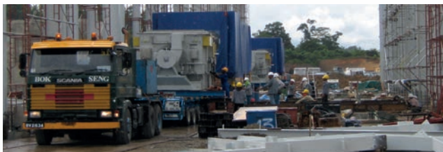
110 Tons Generator and Turbine Engine delivery from Muara port to Tutong Power Station in Brunei.