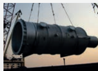
Loading of parts and accessories for oil vessel at Port Klang.