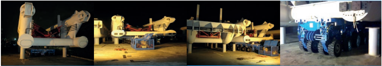
Sled Stinger Measurement: 32.60m x 6.70 m x 6.03 m / 144.50 ton Intermediate Stinger Measurement: 24.64 m x 6.15 x 4.27m / 103.4 ton HITCH STINGER Measurement: 24.64m x 6.15m x 6.03m / 101.40 ton Lifting of Stinger USING 200 METRIC TON CONMENTTO TO MOVE ONE SECTION STINGER "Dextrans Singapore delivered completed Stinger and completed Christmas tree modular units from Singapore to Brazil"

"In Projects Forwarding, Dextrans specializes in the industry verticals of Oil & Gas/Offshore Marine/Mining Power Generation"