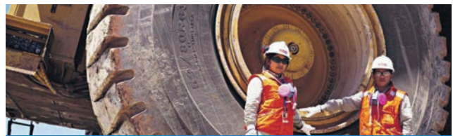
Mining – completing the project delivery of 24,500 cbm consisting of 14 chartered inland barges from Nantong to Shanghai, China for final delivery port into Antofagasta, Chile by breakbulk vessel of mining equipments and tyres.