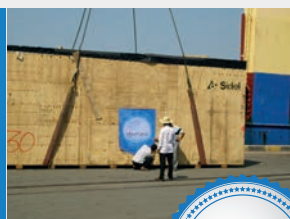
Cambodia Project Dextrans handled 67 x 40' OOG Flat racks and 3600cbm of breakbulk cargo (with heaviest piece of 115 tons) from Italy and France into Shihaknoville Cambodia with the final factory destination in outskirts Phnom Penh in October 2012. The project installation and delivery took 2 weeks for the building of a bottling conveyors for the 2 production lines for Angkor Beer..