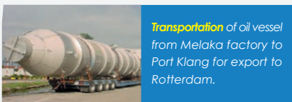
Transportation of oil vessel from Melaka factory to Port Klang for export to Rotterdam.